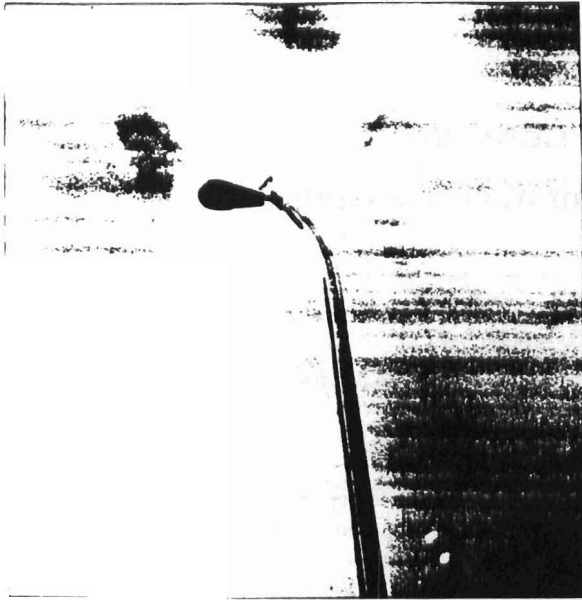
4/22/99 TR 1886 WOODEN Streetlight POLE